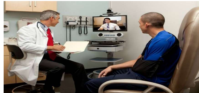
simulation/role-play with feedback