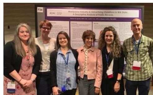
2019 North American Cannabis Summit